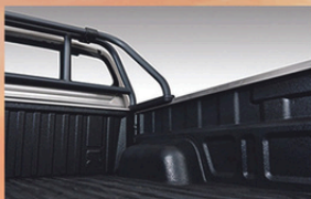
Strong Loading Capacity