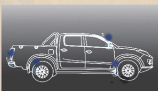
Improved Driving Security