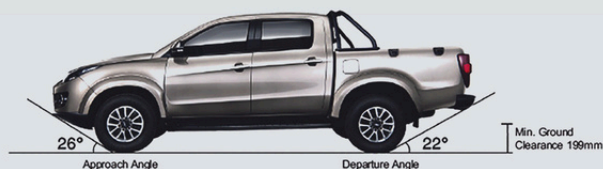
Strong Off-Road Performance