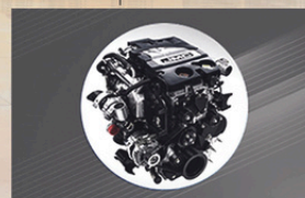
Excellent Engine Power