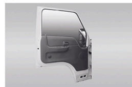
STYLISH DOOR TRIM