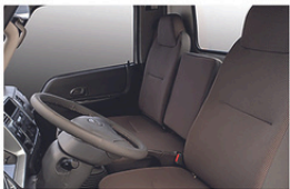
COMFORTABLE & SAFE CABIN