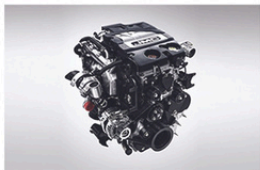
4-CYLINDER IN-LINE CRDi DIESEL ENGINE