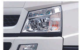
NEWLY DESIGNED HEADLAMP