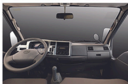
ERGONOMIC DESIGNED DASHBOARD