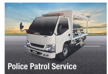
Police Patrol Service