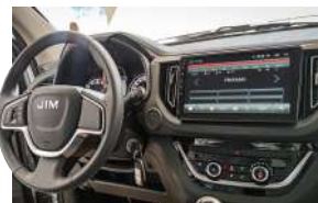
TOUCH SCREEN DASHBOARD PANEL