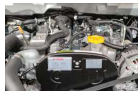
EXCELLENT ENGINE POWER