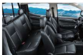
SPACIOUS PASSENGER CABIN