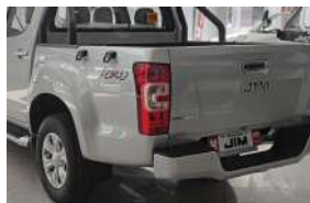
STRONG LOADING CAPACITY