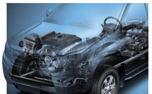
RIGIDITY CHASSIS WITH HIGH GROUND CLEARANCE