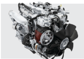
HIGH EFFICIENCY ENGINE