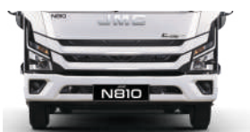
NEW MODERN AERODYNAMICS DESIGN