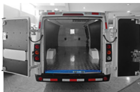
7.5 m 3 CARGO CAPACITY